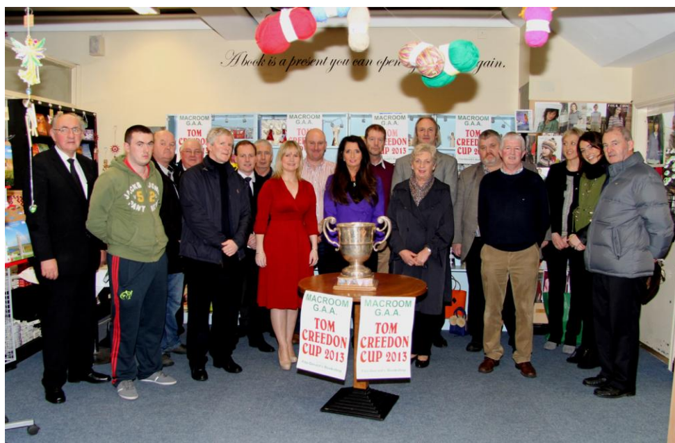
Group pictured at the launch of the Tom Creedon Cup.

See www.gaacork.ie for Tom Creedon and Tadhg Crowley Cup fixtures.