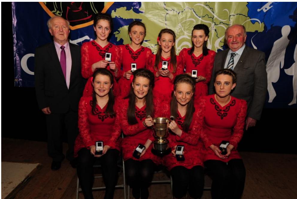
Boherbue – Munster Champions, Rince Fóirne