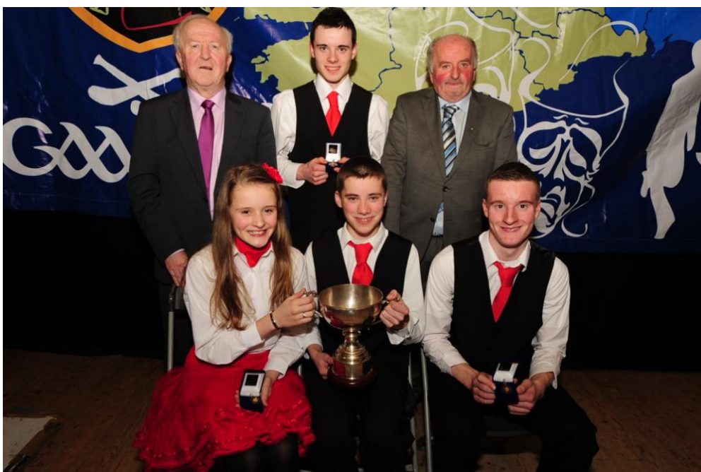
Clyda Rovers – Munster Champions, Ceol Uirlise.